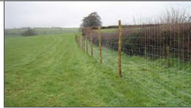
Inset - Typical Fence Style